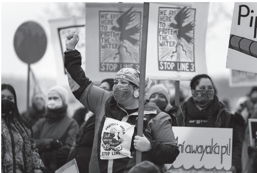
Masked Indigenous Minnesotans and supporters demonstrate at a "We are Here to Protect the Water, Revoke the Permits!" Rally in St. Paul on January 29, 2021.